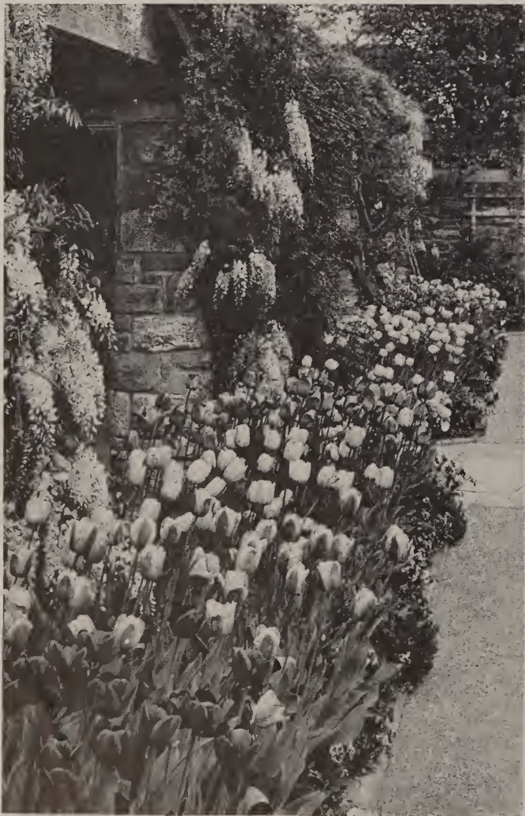
Darwin Tulips in bloom with Wisteria

this so. There are a very limited number of varieties which are distinct in color, of good texture, large in size and with strong stems. These we list for your consideration. Many of the finest exhibition varieties in our list can now be purchased at much lower prices than last year. We urge a trial of these new and rare kinds.